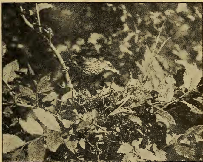
Approaching with Food.

the ground and contained two nestlings and two eggs. This pair after many trials succeeded in raising all four of their brood. The nest was close to a wagon track leading to a sand pump on the river and the passing of the wagons kept them in a constant state of alarm. The second was placed in a small elm and the four nestlings it contained were successfully reared. The third, in a willow, held one naked young which disappeared the next day. The fourth, contain-